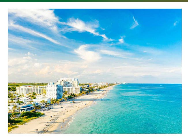
Winter 2024 BOARD MEETING: