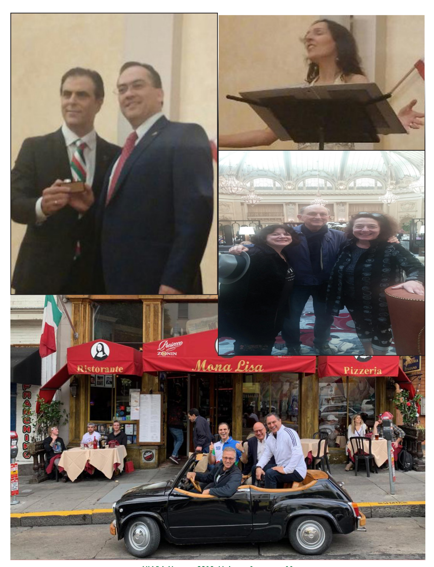
NIABA News • 2019, Volume 1 • page 11